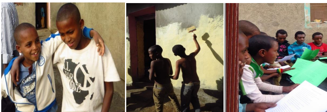
Feel like home