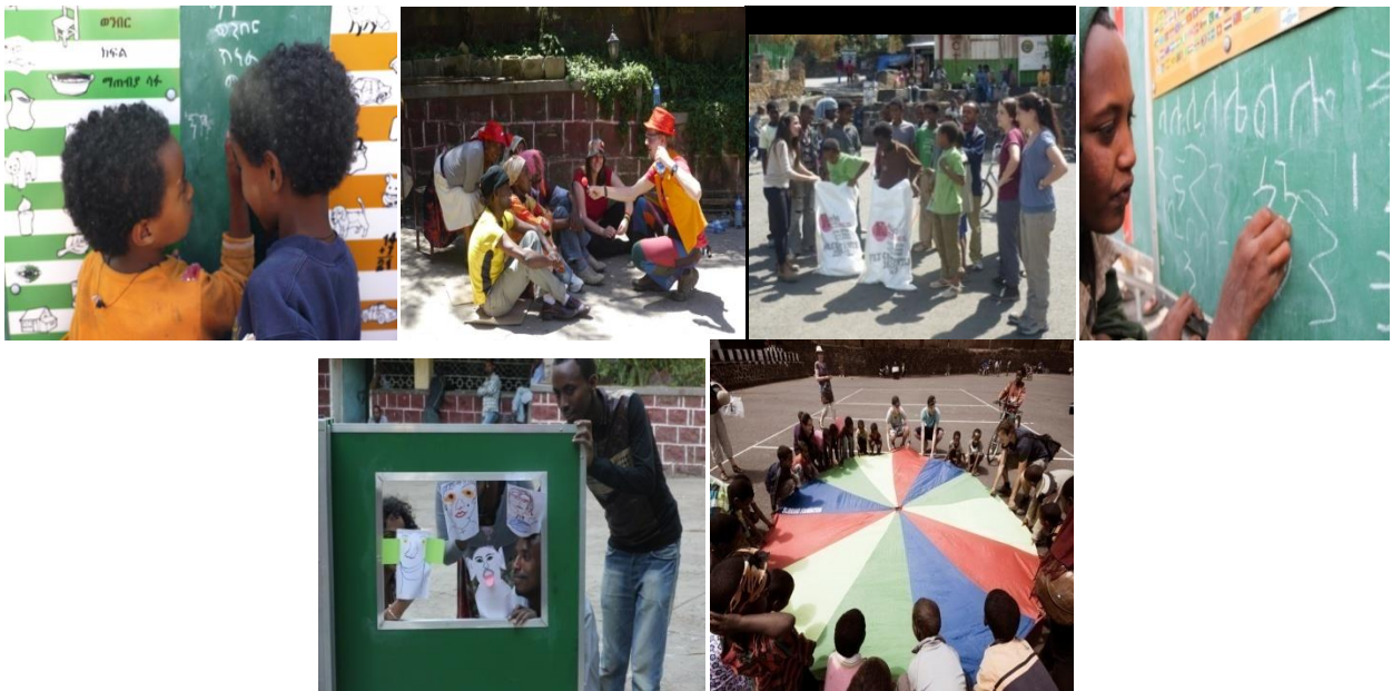
Sport activities after mobile school