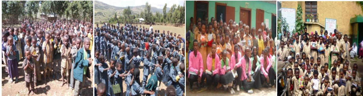
Before Dabirka Rural area

The school teachers and directors recommended us to work collaboratively with them and this makes the follow up process easily; because they know their student very well more than women, children, and youth affair's office.