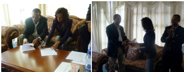
Sign the memorandum of understanding