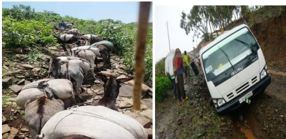
Different transportation of materials