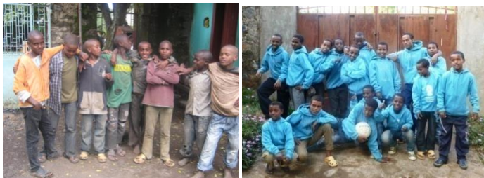
First day new boy's house

In the last budget year, we opened one new home for Boys who are street children near a girl's home in Kebele 18; all of the boys were living on the streets of Gondar. Now the children are safe, got their basic need, studying and living with their model parents and big brother. They are feeling like home and they adapt the neighbourhood easily. It was very easy to get great friends from their neighbourhood.